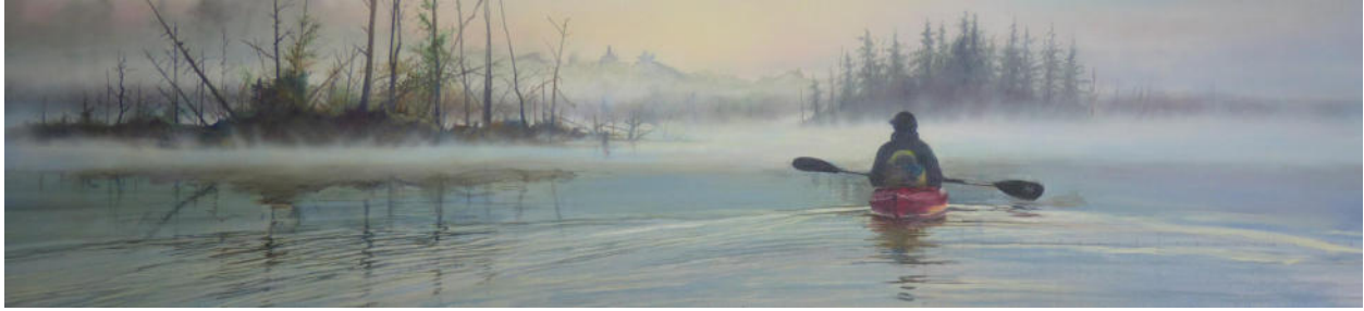
In process "Misty Morning Communion", Golden Open Acrylic on canvas.

This is a great chance to try acrylic painting. All the professional materials and reference photos are provided. At the end of class you keep the canvas and you can buy the materials if you want. We will be using a special process that allows acrylic paint to remain workable on the palette for weeks yet is dry to the touch on canvas in minutes.