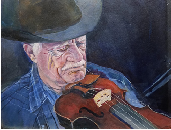
In process, Golden Open Acrylic over watercolor, "Fiddler"