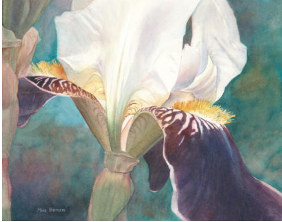
Watercolor "Regal Velvet"